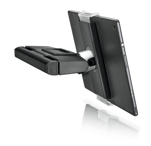
*Fits all tablets 7" up to 13"

A tablet is a lifesaver when it comes to keeping kids entertained in the car. But you don't want to worry about it rolling around when you are driving. Our mount makes it easy to securely attach a tablet in a comfortable viewing position to the back of a headrest.